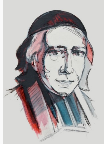
Artist: Luis Lonjedo, Valencia, Spain

Fortitude is the moral virtue that ensures firmness in difficulties and constancy in the pursuit of the good. It strengthens the resolve to resist temptations and to overcome obstacles in the moral life. The virtue of fortitude enables one to conquer fear, even fear of death, and to face trials and persecutions. It disposes one even to renounce and sacrifice his life in defense of a just cause. (1808).