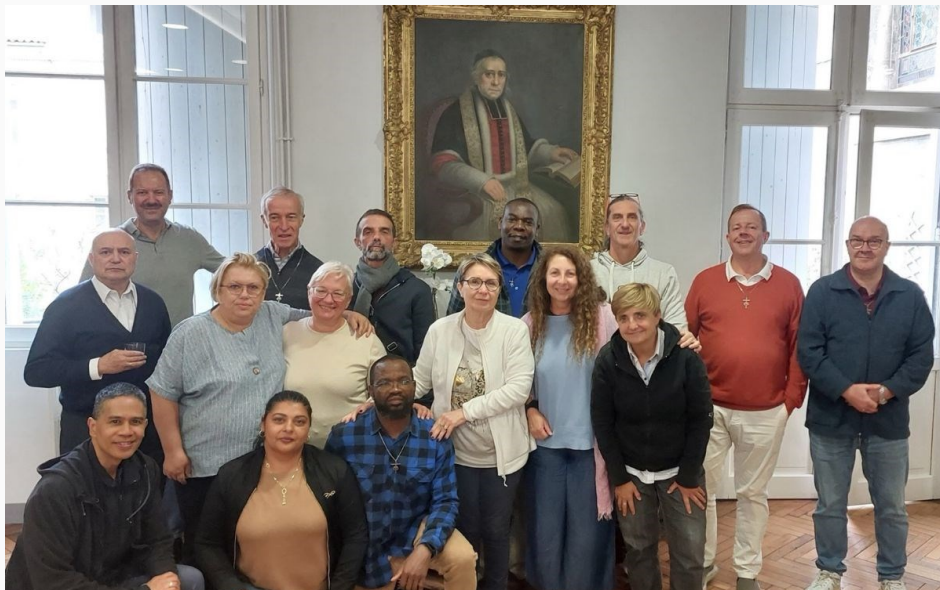
Community of the General Administration and staff of Via Latina 22 in front of the portrait of Blessed Father Chaminade, La Madeleine, Bordeaux.

From September 24-26, the Community of the General Administration and the staff of Via Latina 22 made a pilgrimage to Bordeaux. The occasion of this pilgrimage was the celebration of the 25th anniversary of the beatification of Blessed Father Chaminade. Together they had the opportunity to visit the most significant places in the life of our Founder and to deepen their spirituality, thanks to the explanations of the religious who are very familiar with the city of Bordeaux. They were also able to celebrate the Eucharist and pray in his room, in the chapel of La Madeleine, and at his tomb in the Carthusian Cemetery in Bordeaux.