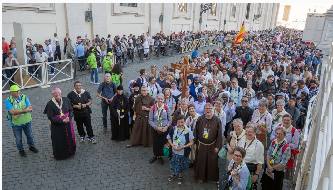
A group of consecrated men and women ready to go through the Holy Door at St Peter's Basilica.

From October 8-11, the Jubilee of Consecrated Life was celebrated in Rome. 16,000 men and women religious and members of secular institutes came from all over the world to participate. Among them was a small Marianist delegation from the Alliance Mariale, the Daughters of Mary Immaculate and the Society of Mary.