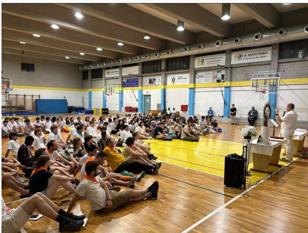
Istituto Santa Maria

Day 1, Thursday, July 31, focused on identity. Participants met at the Marianist school Istituto Santa Maria to reflect on “Who am I? Who are we?” Inspired by Blessed William Joseph Chaminade’s words, “Let us be before men what we are before God,” they prayed, shared Scripture, and introduced their countries with symbolic objects.