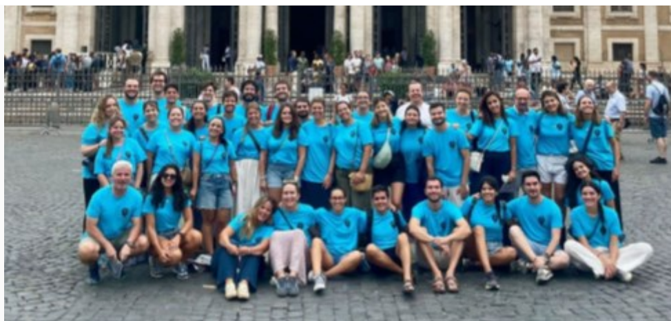
The group of teachers and religious in front of the Basilica of Santa Maria Maggiore.

This initiative of the Provincial Council responds to the calls of the last General Chapter on the pastoral care of young people, and consisted of a five-day pilgrimage to Rome on the occasion of the Jubilee.