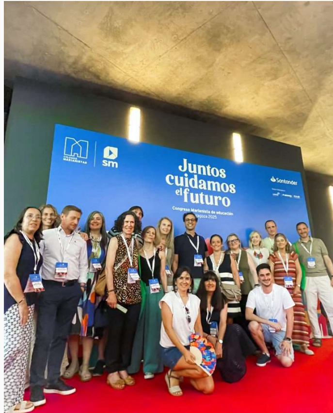
Some participants in the congress.

Highlights included expert talks by national and international educators, 20 school-led projects showcasing creative teaching, and a moving Eucharist at the Basilica of El Pilar. Archbishop Carlos Escribano encouraged all to “Dare to dream like Chaminade.”