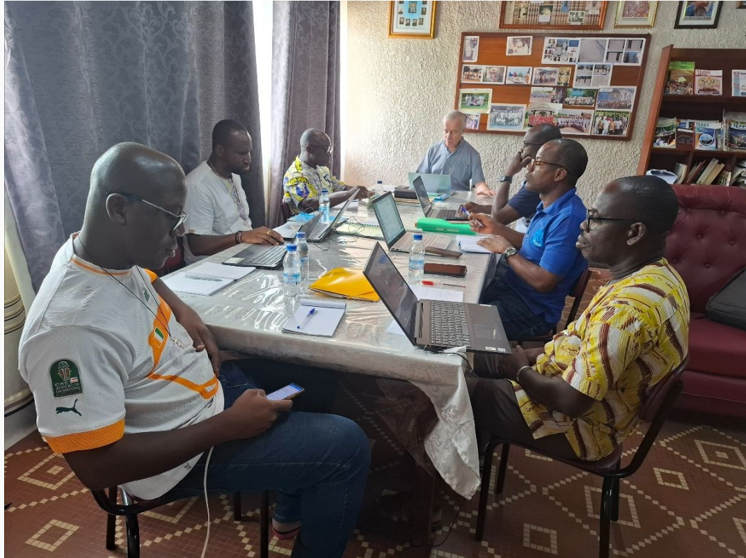
Meeting with some members of the District Council.

We thank the District Superior and his council for organizing this visit. Our gratitude also goes to all the brothers of the District for their welcome and openness during our interviews. The District of Côte d'Ivoire is dynamic and has a lot of potential. It also has many challenges given its context. However, there are many reasons for encouragement. Let us pray for our brothers in Ivory Coast and their ministries.