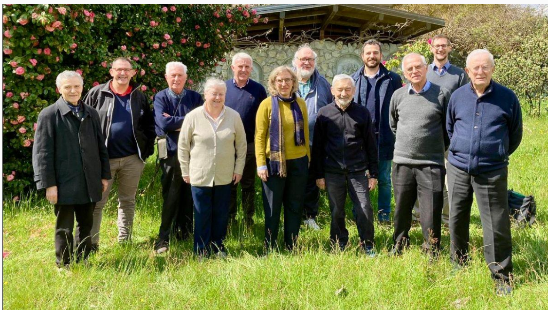
Participants in the garden of Villa Chaminade in Pallanza.

The annual meeting of the European Commission for Marianist Education took place from April 3 to 5 at the Chaminade House in Pallanza, on the shores of Lake Maggiore. The community residing in Pallanza did a splendid job in hosting this meeting. Representatives of Marianist education from France, Italy, Spain and Austria have been meeting regularly to develop common projects for Marianist schools in Europe