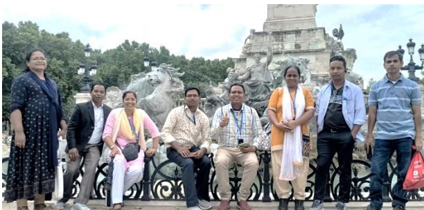
Participants from India.

During the program, resource persons from the four branches of the Marianist Family presented carefully chosen and well-delivered topics. The agenda included presentations, discussions, and reporting sessions. The topics covered a wide range of subjects such as Marianist history, the origin of the Marianist movement, religious life, the Marianist family, the Pope's calls to synodality, the cry of the Church listening to the world, and the challenges of being religious in today's world. Apart from the enriching program, participants were privileged to visit significant places associated with the Marianist heritage. Among these were those of Blessed Fr. Chaminade and Blessed Mother Adèle in France. The group visited Zaragoza, where they had the opportunity to see the SM school and the Cathedral. The following week, they traveled to Bordeaux, where they visited several churches, the Madeline community, and the tomb of Chaminade himself. St. Sebastian was also on the itinerary, where they visited a school.