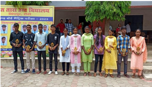
Honouring the top eleven students for their outstanding performance in the 10th standard exam.

On July 7, the Prabhat Tara M/H School, Singhpur, held a parents’ meeting to celebrate and honor the top eleven students who passed the recent 10 th standard exam. This significant event marked a milestone for the school, as it was the first meeting of its kind in approximately 20 years.