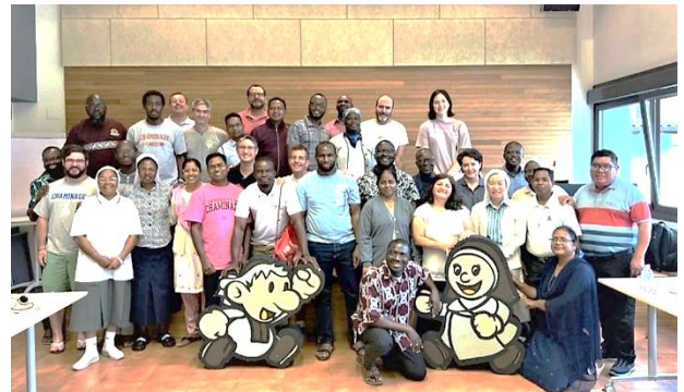
A group picture of the Horizon participants.