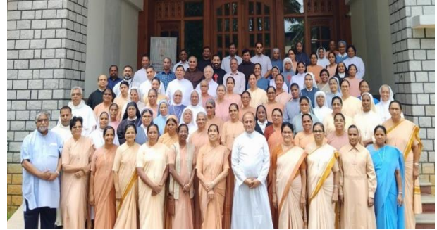
The KRCR annual assembly participants.