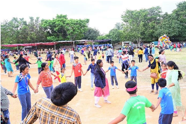
A teacher leads a group play, strengthening bonds between students and parents.

On July 22, St. Joseph Chaminade Academy celebrated Family Day, an important occasion aimed at reinforcing the significance of family, fostering a positive and inclusive school environment, and enhancing the overall well-being and academic success of students. The event strongly promoted the idea that families play a vital role in a child's life and education, and their active involvement is both welcomed and valued within the school community. The festivities brought together all the students, along with their parents and grandparents, who actively participated in a wide array of enjoyable activities, games, and dances on the