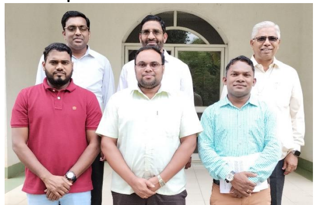
The workshop participants.