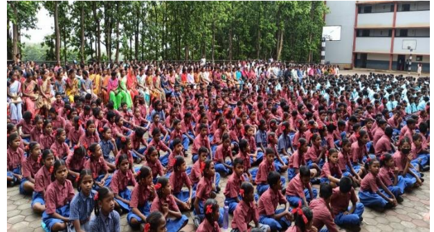
Parents and students attentively engaged in a meaningful meeting with teachers at the school.

Approximately 800 parents attended the meeting, demonstrating a remarkable turnout and a strong sense of community involvement. The gathering provided an excellent opportunity for parents to engage with the school administration, teachers, and fellow parents, fostering a collaborative and supportive environment.