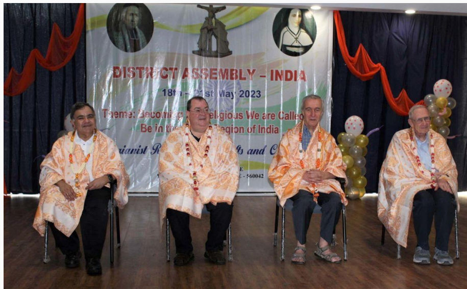
Members of the GA and PA receive shawls and garlands in appreciation of their accompaniment

Throughout the coming year, in ongoing dialogue with the two administrations, the District Council of India will continue working on this theme with the members of the District. Eventually, it is expected that the Council will formally request of the Superior General that he, with the consent of the members of the General Council, issue the decree establishing the Region of India. It is foreseen that the process could be completed by May 2024.