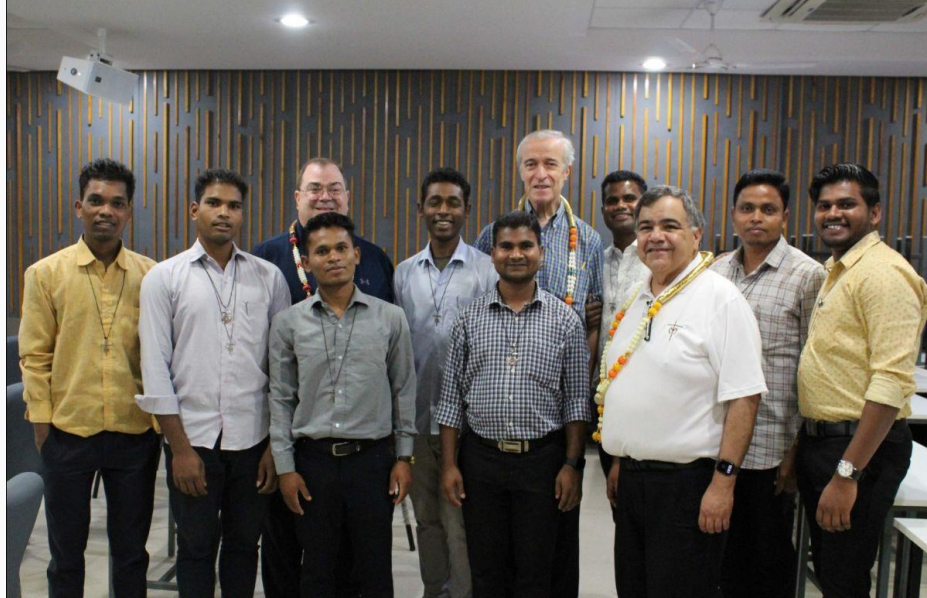
Religious of the Scholasticate Community pose with members of the General and Provincial Administrations

Throughout the coming year, in ongoing dialogue with the two administrations, the District Council of India will continue working on this theme with the members of the District. Eventually, it is expected that the Council will formally request of the Superior General that he, with the consent of the members of the General Council, issue the decree establishing the Region of India. It is foreseen that the process could be completed by May 2024.