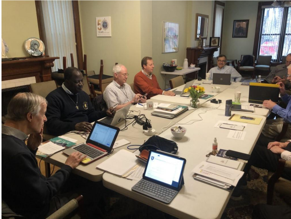
The General Council meetings with the Provincial Council at the conclusion of the visitation.

Of course, there are challenges in the Province. The very size of the Province is a great challenge for the members of the Provincial Administration, and many efforts are made to assure unity. Nevertheless, all are working to preserve and ever-strengthen Marianist religious life within the Province. The Council expressed its gratitude, not only for the welcome received, but also for the important role that the Province plays in the global SM. Let us remember our religious and apostolic works of this Province in our prayers, asking God's blessings on them, and Mary's maternal protection!