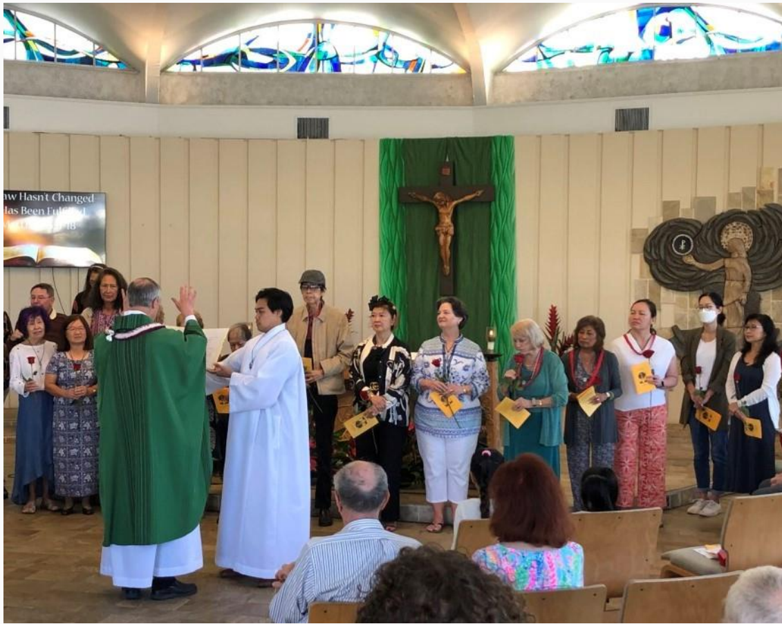
Blessing of new MLC members making their commitments in Honolulu.

The Marianist Family is also quite active in the USA. In addition to the religious of the SM, the FMI sisters are few, but quite effective in collaborative ministries in San Antonio and Dayton. Thankfully, they too, have several vocation candidates/novices. The lay members of the Marianist Family come from various groups: Marianist Lay Communities, Affiliates, The State (consecrated laypersons), and committed collaborators. All of these are active, mostly in areas where there are SM communities and works, but also in some areas where we are not present. For the MLC, there is now a full-time, paid, executive director, who is overseeing substantial expansion of their organization, formation, and other initiatives.