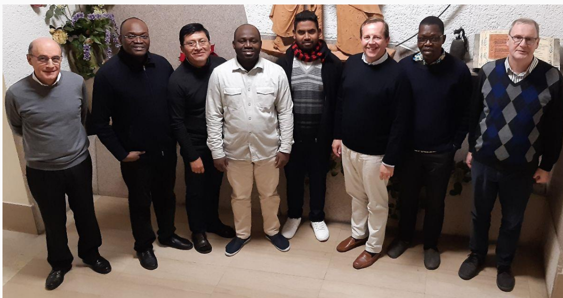
The seminary community and the two members of the visiting commission