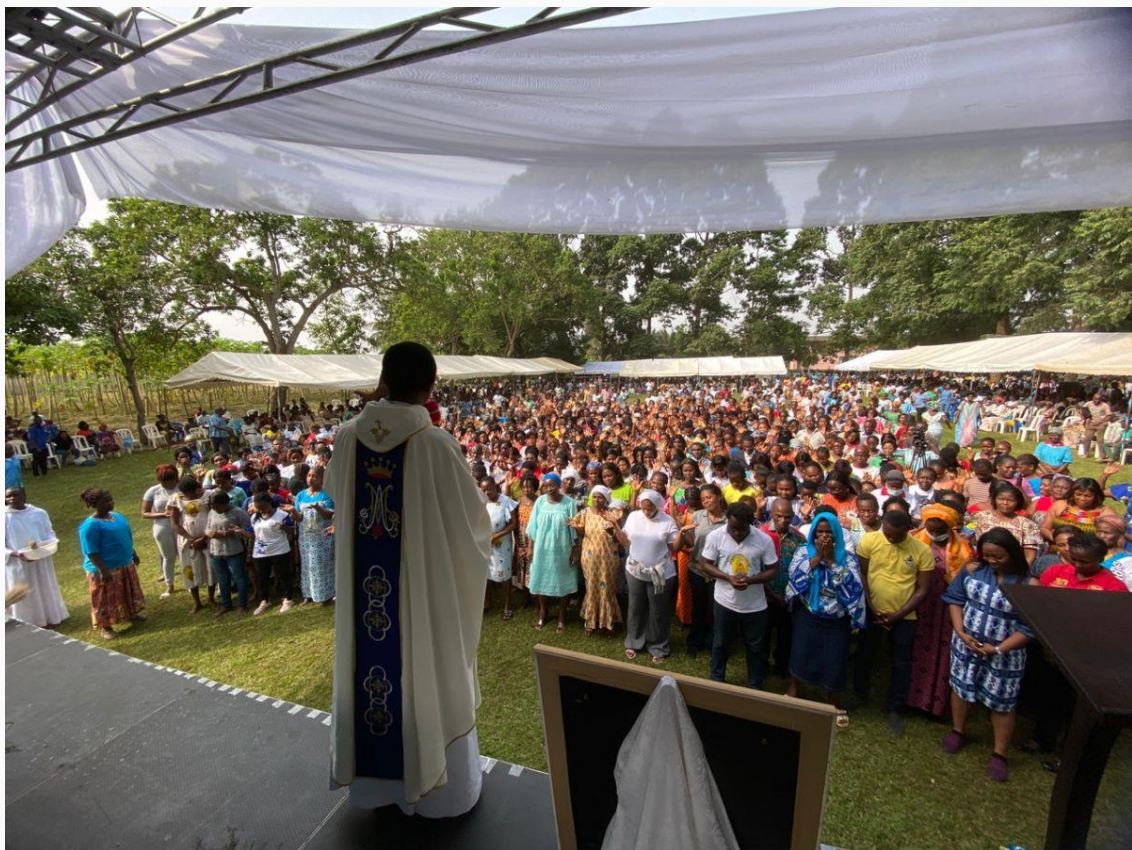
Vast assembly of the faithful gathered in prayer at the tomb of Father Halter.

The pilgrimage took place on Saturday, January 7, 2023. The motto for the pilgrimage was: "Jesus proclaimed the kingdom of God and cured every kind of disease" (Mt 4:28). Nearly 2,000 pilgrims gathered to pray at the tomb of Father Halter.