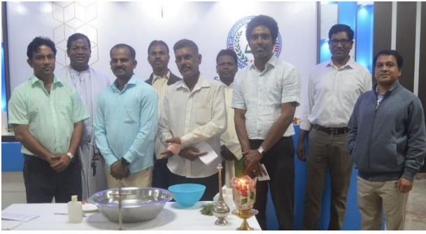
The District Council members with the engineer and his term members.

After the prayer service, the engineer, contractor, and the other laborers who built the school were thanked by the District Administration for their commitment and faithfulness in completing the work. The Marianists from the Bangalore area participated in the prayer service which was followed by dinner at St. Joseph's community.