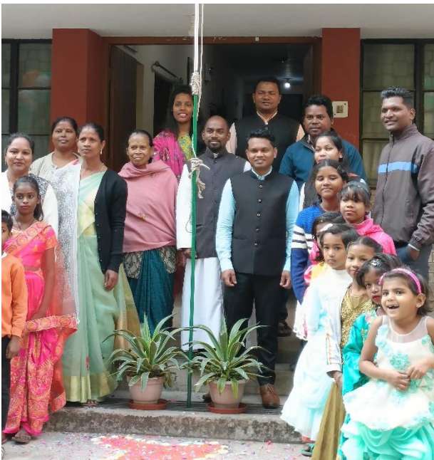
A group picture REDS Ranchi staff, Brothers and children.