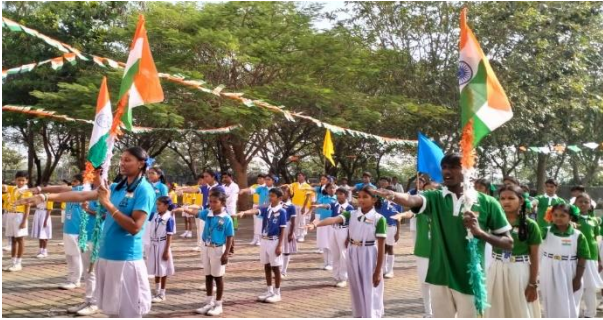
Jacob Gapp School conducted special assembly and cultural activities to celebrate the day.

On January 26, India celebrated its Republic Day with much enthusiasm and joy because it honors the day on which the Constitution of India came into effect 74 years ago. The Marianist educational institutions across the District celebrated Republic Day with flag hoistings and various cultural programs.