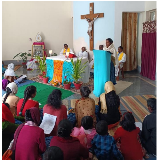
The participants gathered in the community chapel for the Eucharistic celebration.