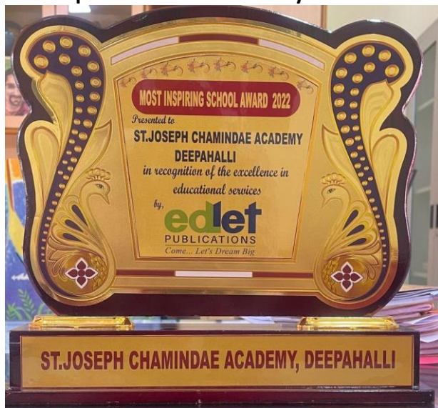
The recognition award plaque.