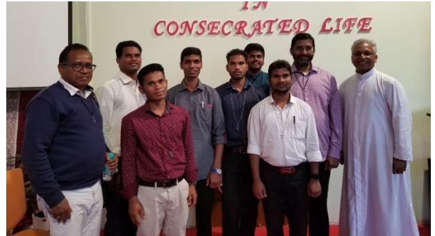
The Scholastic community staff and the Brothers with a workshop presenter.

From January 28-29, the scholastic community staff along with the second- and third-year scholastics attended a two-day workshop at Sanayasa. The topic of the workshop was "The Gift of Fidelity and the Joy of Perseverance." The workshop elaborated important issues regarding religious life in India: the importance of discernment, accompaniment, fidelity, why one might leave or remain in their congregation, and commitment. This workshop was educational and fruitful for the participants.