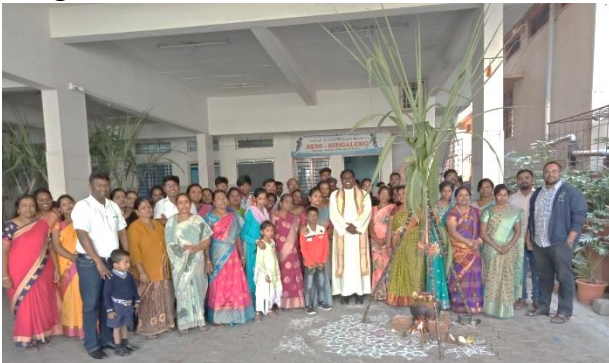
A group picture of the Pongal celebration participants.

Pongal is a festival celebrated in the Southern part of India to thank Mother Nature for a plentiful harvest. It is usually celebrated from January 14-17. This harvest festival is known as Makara Sankranti in both Karnataka and Andhra Pradesh, and as Sukarat in central India. This year the staff from REDS Bangalore, Chaminade School, and the Skill Training Centre in Deepahalli came together to celebrate the festival in a spirit of unity and joy.