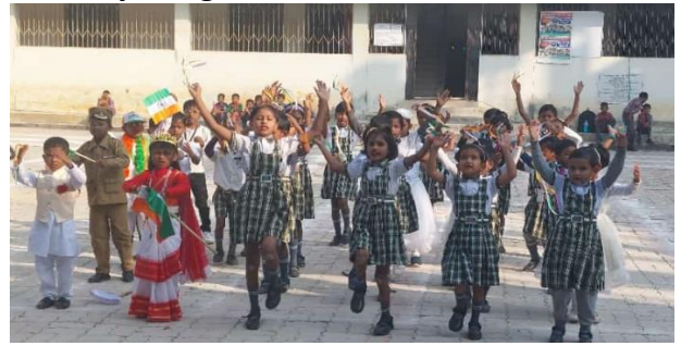
The students took part in cultural activities to commemorate the Republic Day.