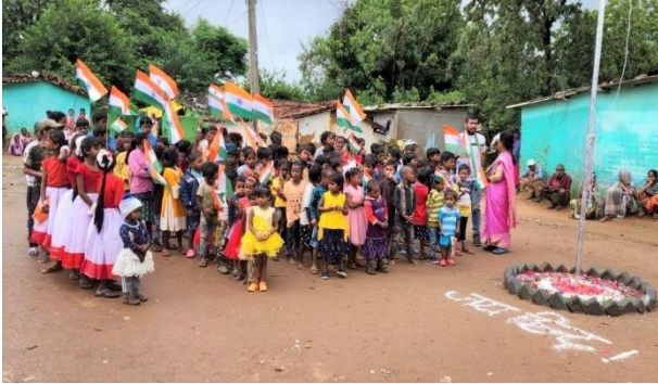
REDS Ranchi children gathered for the flag hoisting.