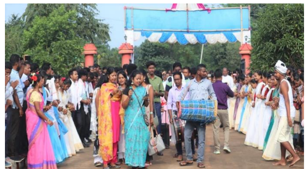
The parish women's group began the feast day with a procession and tribal dances.