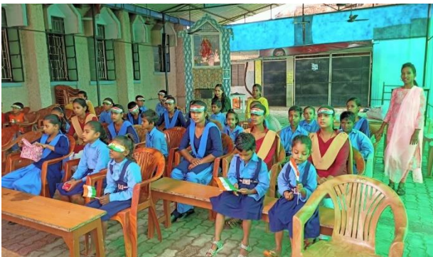
Participants of the day.

On August 15th, REDS Patna and the Chaminade Training Institute celebrated