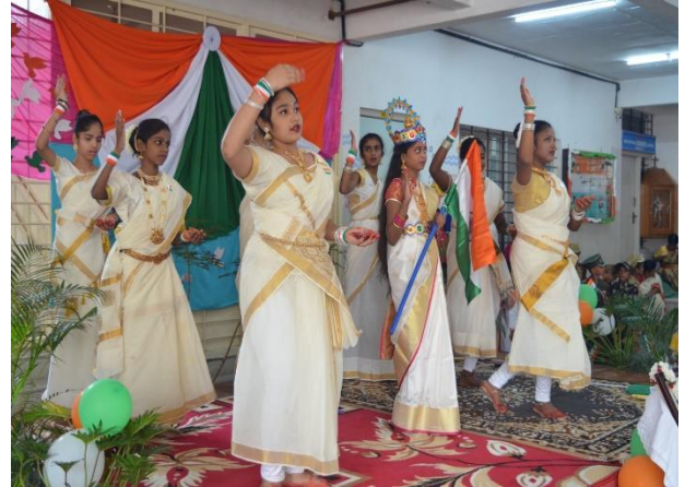
Chaminade School students perform a dance during the celebration.