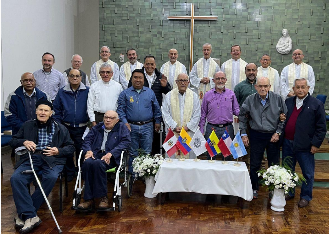
All SM religious participating in the celebration of the beginning of the new Latin America Region