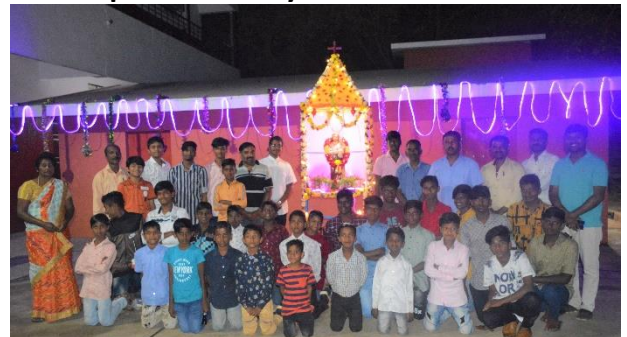
Participants of the celebration.

Since St. Joseph is the patron saint of the St. Joseph's Community, every March 19 brings immense joy and enthusiasm to the Brothers. St. Joseph's statue was decorated with flowers, and it was carried in a prayerful procession around the Deepahalli campus by the Brothers. The feast day celebration concluded with a special prayer and a grand supper for all the participants.