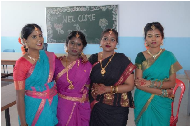
REDS Bengaluru SHG members.