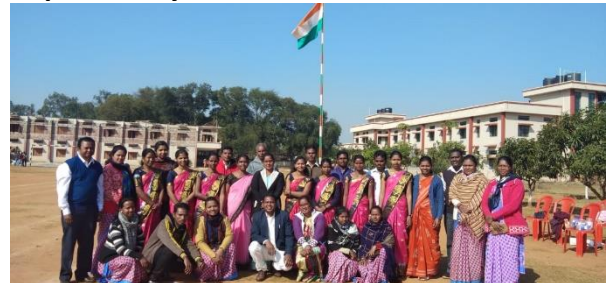
A group picture of St. Joseph's School, Budakata, teachers and the Brothers.

India celebrated its Republic Day on January 26. The day is celebrated with much enthusiasm and joy because it honours the