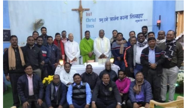
A group picture of the retreat participants.