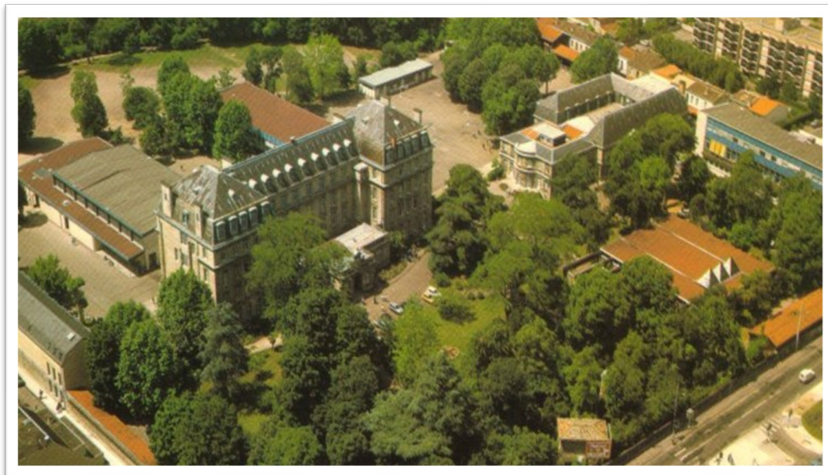
Sainte Marie Grand Lebrun as it appears today, in Bordeaux

the section of the city called Bourdeaux-Caudéran, is the historical successor of this first Marianist school.