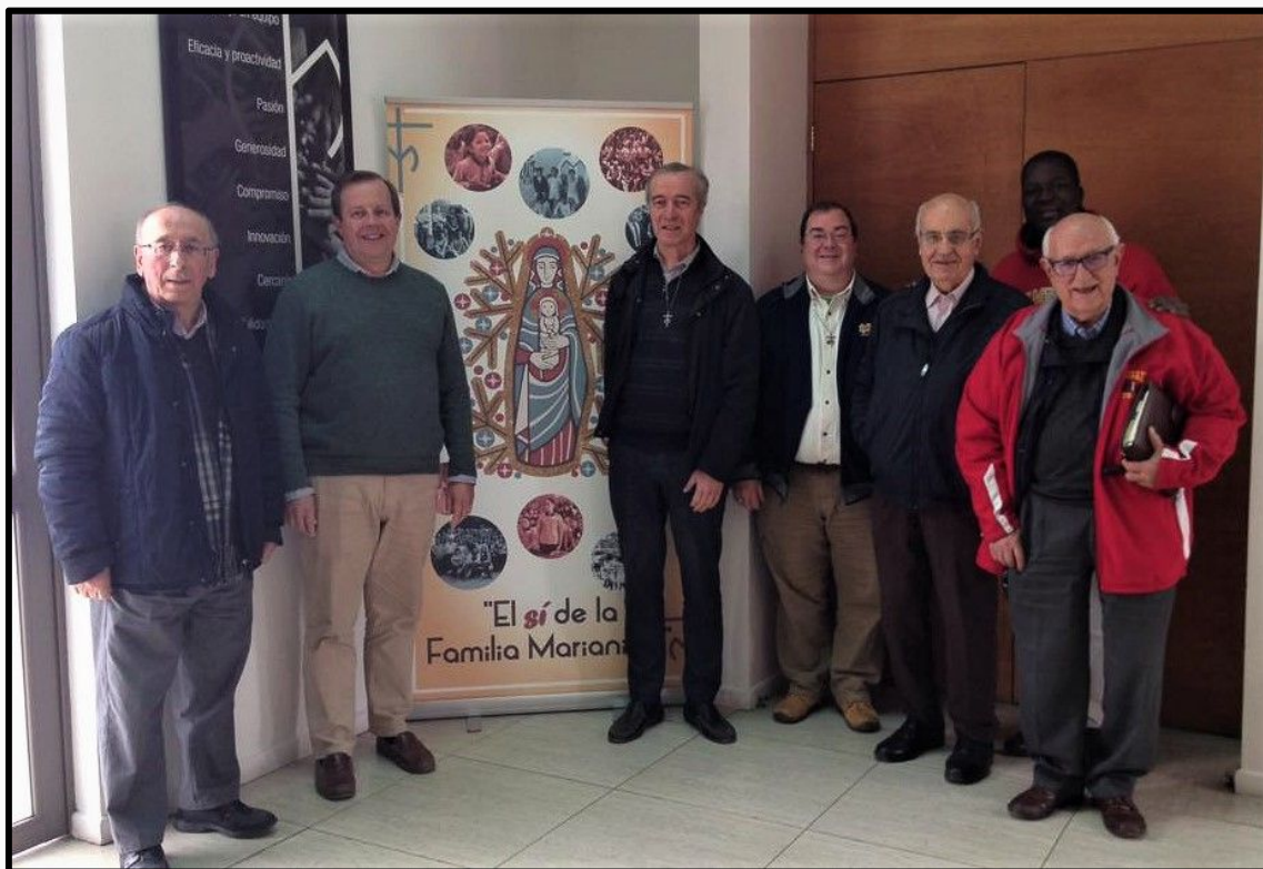
Members of the General Council and the Regional Council.