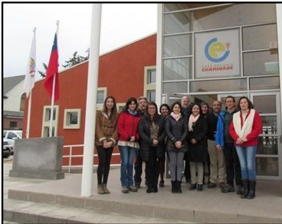
Casa Estudio Chaminade, Linares.

There are 19 members of the Region of Chile. In addition, one member of the Region of Columbia-Ecuador serves as Novice Director at the Latin American Novitiate located in Santiago. The Region's mission is heavily concentrated in education, with 5 colegios and the new Casa Estudio Chaminade. Four of these are located in the Santiago area, while the fifth school and the Casa are in Linares, several hours to the south. In addition, the Region engages in various other ministries, including 2 parishes, a university student residence and works of solidarity. In Santiago, there are 4 communities, and another one in Linares.