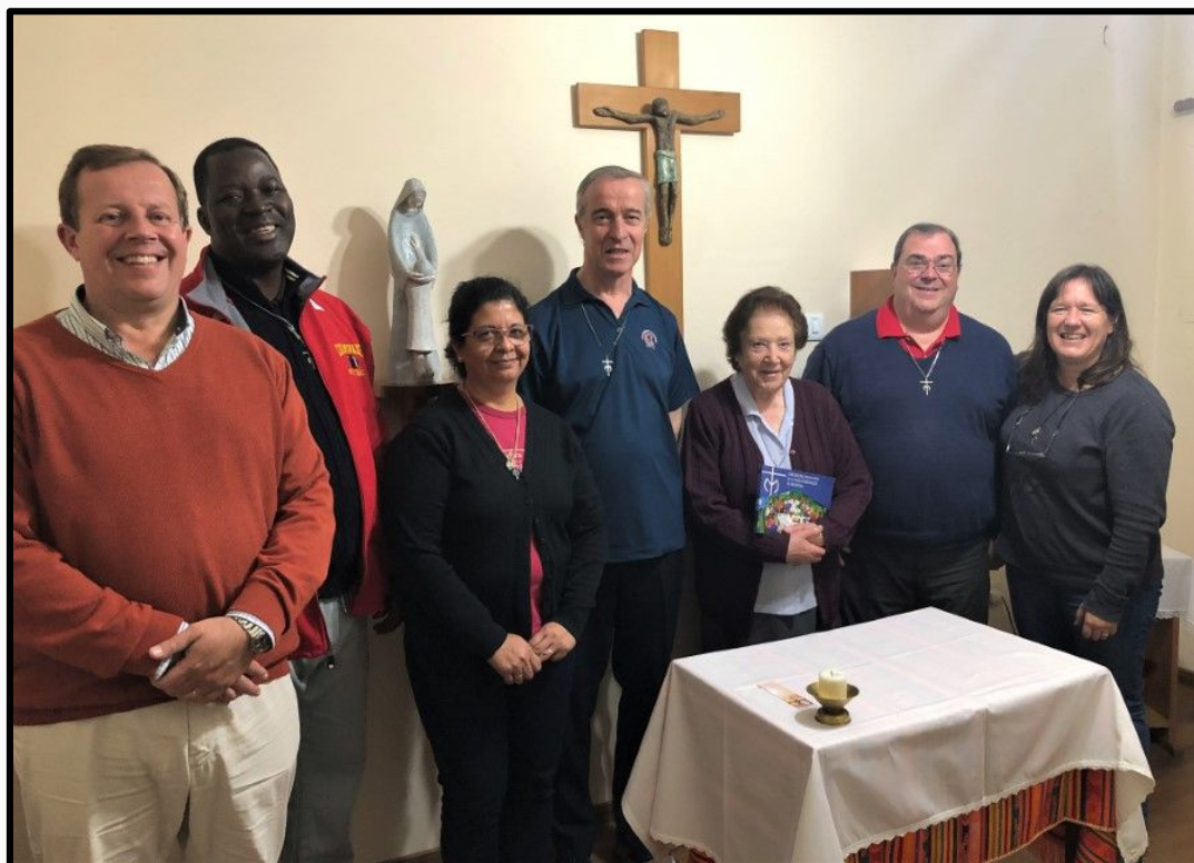
General Council and FMI Community celebrate the first Mass in their new chapel, Buenos Aires.

Two days after celebrating the Resurrection in Rome with Easter joy, the four members of the General Council made the long trip to Buenos Aires, Argentina to begin their visitation of this Region. They were welcomed by the SM religious at the community in the capital city and from there, began the 17-day visitation. There are 11 religious, in three communities within the region. These religious, along with members of the FMI and committed laypeople animate four large schools, two parishes and several social works of solidarity. Two of the schools are in Buenos Aires, and the others are located in Junín and Nueve de Julio. The sanctuary-parish of Our Lady of Fatima serves the faithful in the Villa Soldati section of Buenos Aires, a peripheral barrio with many difficult economic and social challenges. Nearby is one of the largest schools in the Marianist world, also named Our Lady of Fatima, with more than 3000 students! The Parish of the Risen Christ, located in the southern city of General Roca contains 16 different chapels, spread out over hundreds of square kilometers! In all these places and ministries, the presence and collaboration of many members of Marianist Lay Communities give living witness to the grace of our Marianist Charism lived as a Family.