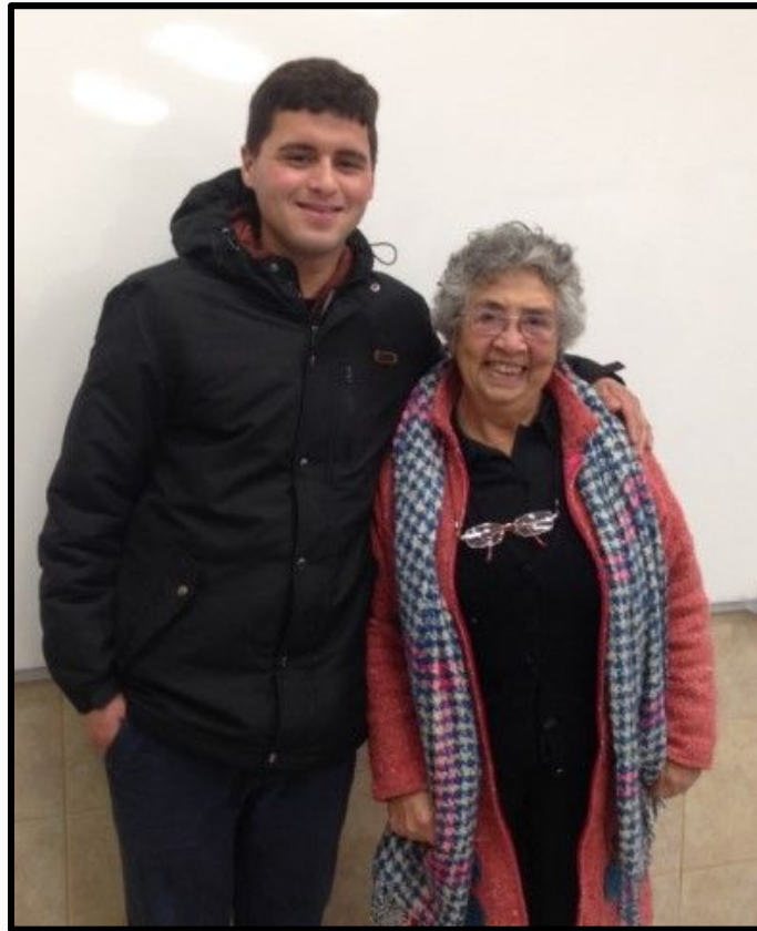
Oldest and Youngest Primary School students, Casa Chaminade.

Let us pray for our brothers, and for all the members of the Marianist Family in Chile!