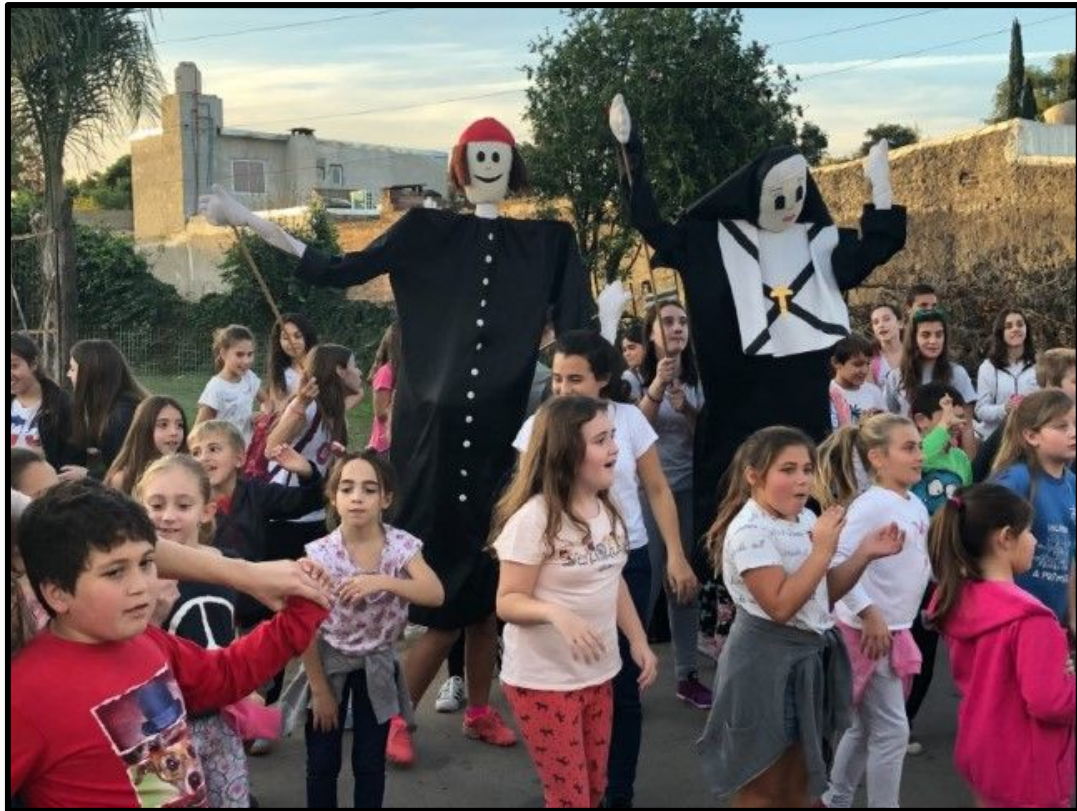
Primary school students celebrate with the Founders, Junín.