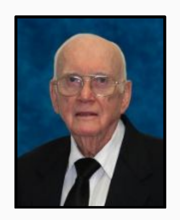
April 10, 2019