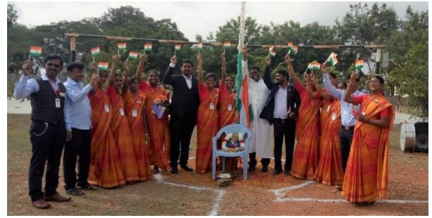
Jacob Gapp School, Khammam organized the flag hoisting ceremony and cultural programs on January 26.

India celebrated its 70 th Republic Day on January 26. The Marianist educational institutions across the District celebrated Republic Day with flag hoistings and various cultural programs.