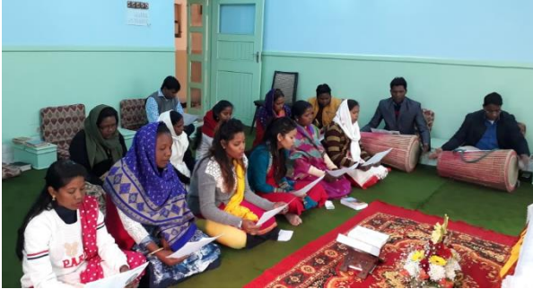
The MLC members gathered in Gyan Deep for a Holy Mass on January 22.

On January 22, The Marianist communities across the District celebrated the feast day of Blessed Fr. William Joseph Chaminade, Founder of the Society of Mary and the Marianist Family. The Marianist communities highlighted the day in their liturgical celebrations.