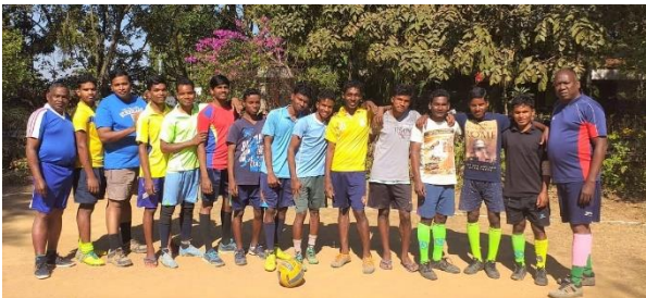
Formation staff in Nirmla Deep organized a volleyball tournament for the pre-novices and the aspirants on January 22.

On January 22, The Marianist communities across the District celebrated the feast day of Blessed Fr. William Joseph Chaminade, Founder of the Society of Mary and the Marianist Family. The Marianist communities highlighted the day in their liturgical celebrations.