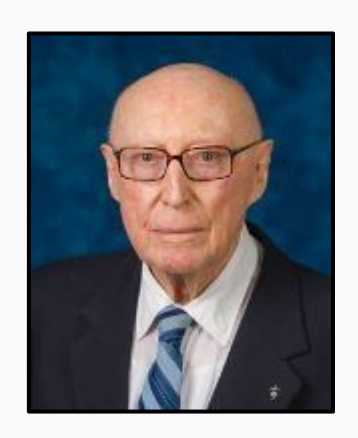
January 16, 2019