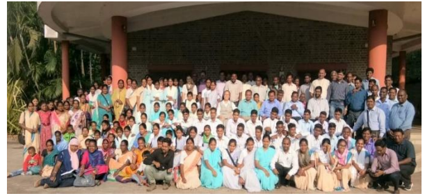
The World Day Prayer participates in Nirmal Deep, Ranchi.

The holy Mass was offered for the growth of the Marianist family in India and the world. The World Day of Prayer services concluded with a fellowship meal.