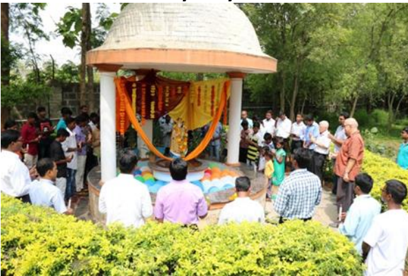
Brothers says the rosary in the grotto of our lady of Velankanni in Deepahalli.