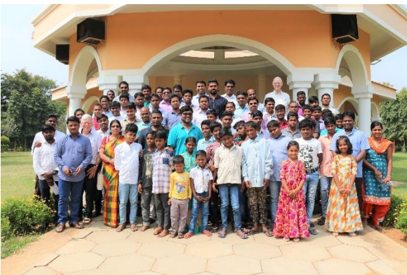
The World Day Prayer participates in Deepahalli, Bangalore