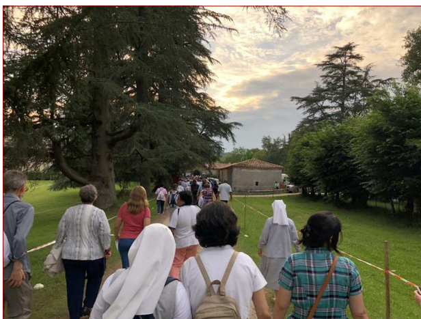
Pilgrims on arrival at the Château de Trenquelléon to attend the theatrical performance about the life of Adèle.