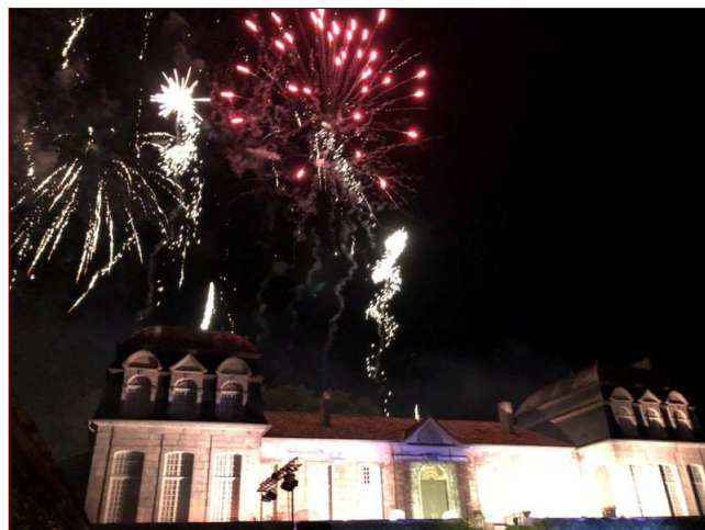
Fireworks over the Château de Trenquelléon at the end of the theater performance.