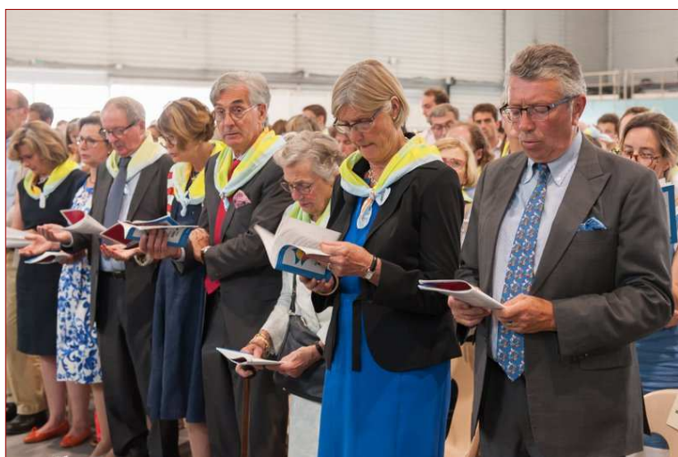
Current family and relatives of Mother Adèle.

Adèle's family was also very present during the celebrations. The sanctity of Adèle has taken root in the family's Christian vitality. Its spirit has passed through the generations up to the present generations, who came for an emotional celebration in honor of their illustrious relative.