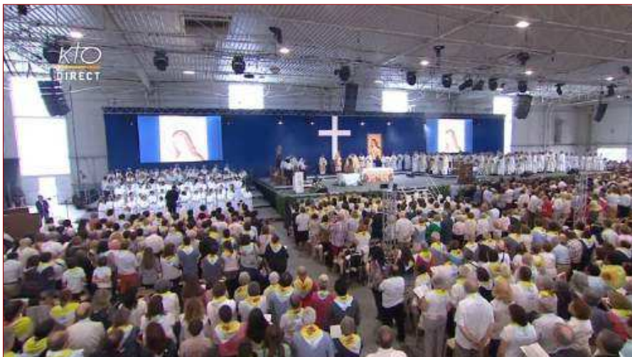
General view of the assembly during the Beatification Mass.