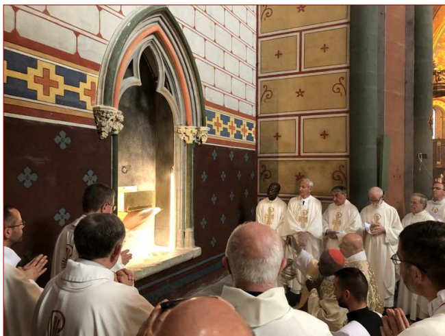
Final moment of the Thanksgiving Mass in the Cathedral of Agen. Cardinal Sarah incenses the relics of Blessed Marie de la Conception.