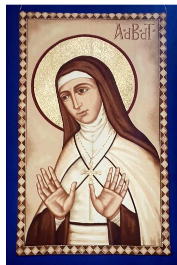
Tapestry with the image of the new Blessed, Mother Marie de la Conception.