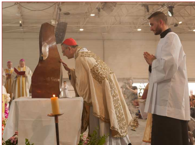
Cardinal Amato venerates the relics of Mother Adèle at the end of the Beatification Mass.