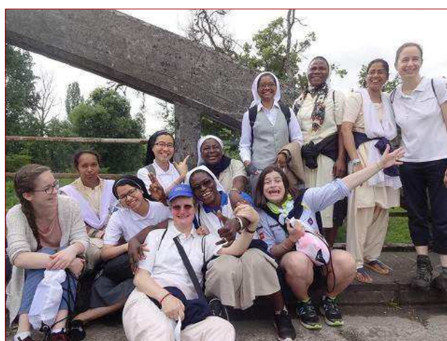
Group of young Marianist religious during the beatification.

Adèle's family was also very present during the celebrations. The sanctity of Adèle has taken root in the family's Christian vitality. Its spirit has passed through the generations up to the present generations, who came for an emotional celebration in honor of their illustrious relative.