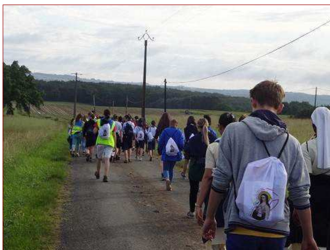
Pilgrimage of young people during the beatification.