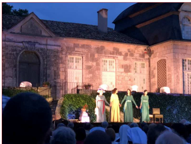
Theatrical representation of young Adèle's life in the Château de Trenquelléon.