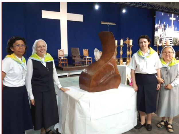
General Administration of the Marianist Sisters before the reliquary with the remains of Mother Adèle.

Pope Francis referred to the beatification of Mother Adèle at the end of his talk at the Angelus prayer that same Sunday morning, asking for applause from the faithful present in St. Peter's Square.