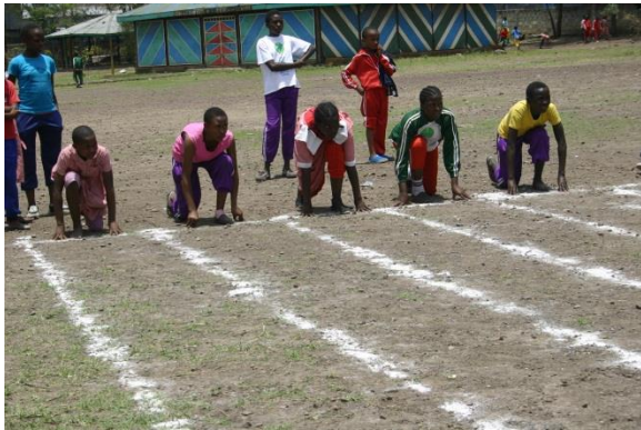
100m for girls

As the school closes there will be a lot of events which will take place. On 4 th April 2018, class eight will have an educational tour to the Meteorological department at Dagoretti corner in the morning and will spend their afternoon in the parliament building. They will have a life time chance to attend to that day's proceedings in the parliament. On 9 th – 13 th there will be a mentorship program for all 70+ students who are under the Marianist African education scholarship program. This happens every holiday immediately the schools close. The aim of the mentorship program is to help and support students' personal growth and to equip them with the understanding the tools to make ethical and informed decisions among others. The school counseling department is in charge of the program.