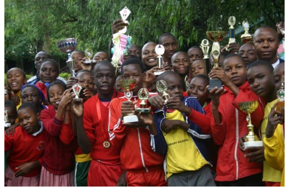
Reds were the overall winners

Have a happy, enjoyable and restful April holiday.