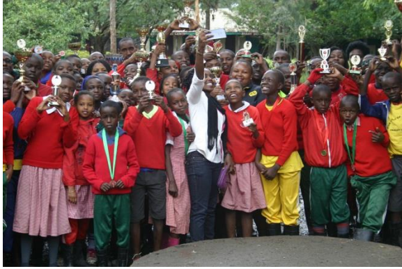
The winners were awarded