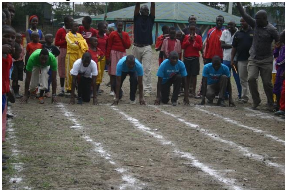
Teachers were not left out