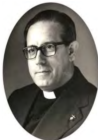
11th Superior General 1981-1991

To all, I ask forgiveness if ever, for whatever reason, even unconsciously, I may have offended them, or if I have not been able to give them all that they could have expected of me as a person, as a religious or as a priest.