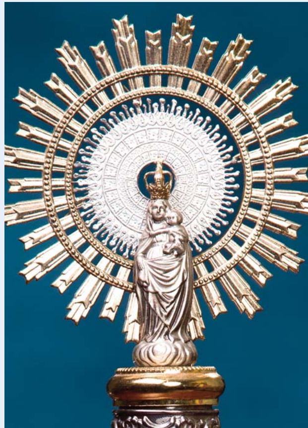
Our Lady of the Pillar — the Pillar Society recognizes planned giving donors