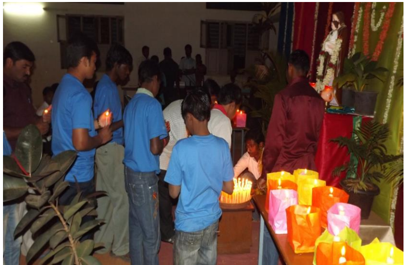
Boys lighting candles on the feast of St. Joseph