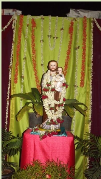
St. Joseph's statue at Deepahalli

The third phase of the District Leadership Development program, KAIROS 3, will be held at Nirmal Deep on October 20-24. It will be followed by the District chapter meeting, convening at the same place. Arrival is for October 20; the program begins early on October 21.