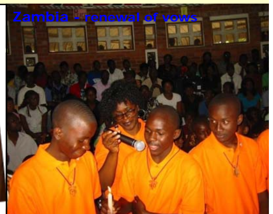
Zambia - renewal of vows

SOCIETE DE MARIE - SOCIETY OF MARY - COMPAÑA DE MARIA