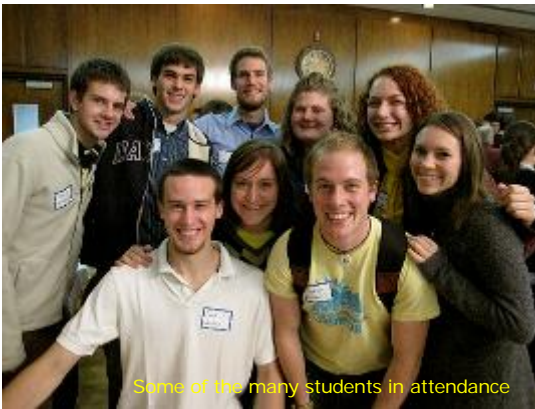
Some of the many students in attendance