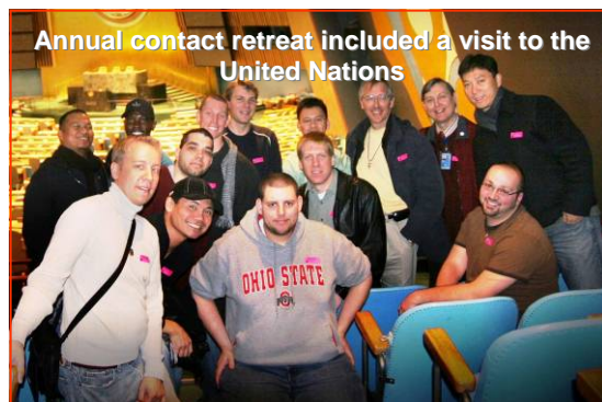
Annual contact retreat included a visit to the United Nations

How are the Vocation Offices organized? We have four vocation offices throughout the Province. There is one at each university: University of Dayton, St. Mary's in San Antonio, Chaminade University of Honolulu; and the national office in St. Louis. I am the only full-time vocation person, but I have an excellent team of 12 people who work part-time in vocation ministry. The vocation teams serve as guides for inquirers (possible candidates) and I work with them after we have started a "discernment" relationship with the individual.