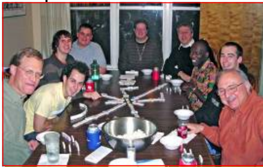
The Trinity Avenue community in Dayton hosted a "live-in" vocation discernment experience in March for four University of Dayton students. In addition to prayer, discussion and meals, the group gathered for a dominoes tournament.