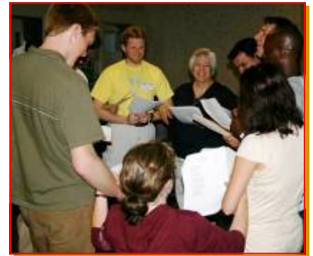
The retreatants gather for Evening song at a discernment retreat in San Fernando, California.