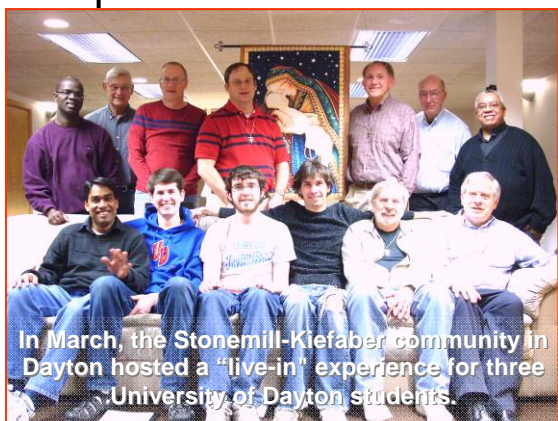
In March, the Stonemill-Kiefaber community in Dayton hosted a "live-in" experience for three University of Dayton students.

What links do the Vocation Offices have with youth work? At the present time, we receive the most inquiries from our universities, the Province vocation web site, the LA Congress (an annual meeting for religious educators held in the Los Angeles area) and referrals from other religious or former Marianists.