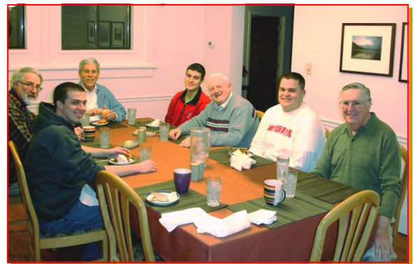
Members of a student Marianist community at the University of Dayton recently joined the Chambers Street community for dinner.

If we believe that we have something good (the charism), then we need to invite and share our lives with others!