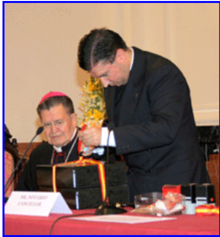
Tribunal documents are sealed before the Bishop by the diocesan chancellor.