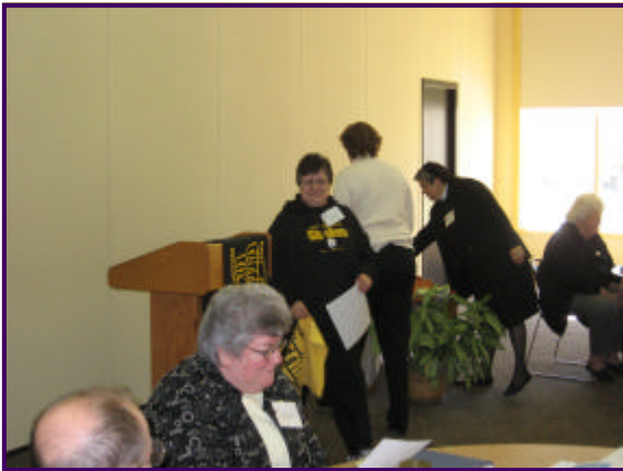
Participants at the San Antonio Workshop

Several religious institutes responded to the NRRO's initial invitation to participate in the pilot process. Based on their level of need, five religious institutes were selected for the first workshop.