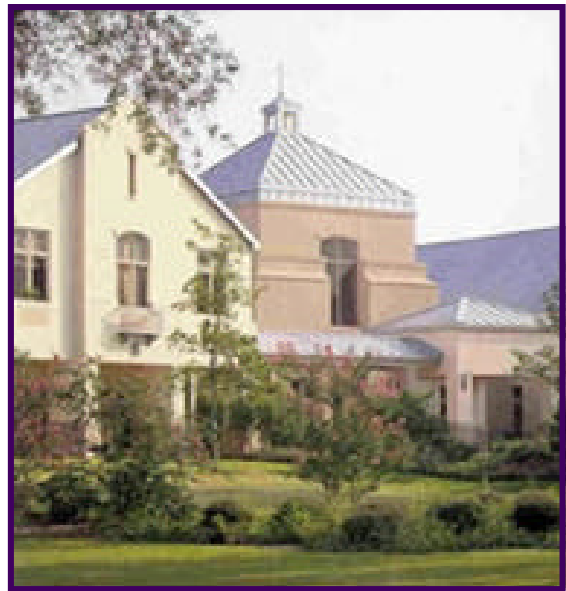
Oblate Renewal Center in San Antonio

In preparation for the workshop, each group reviewed "A Future Full of Hope—Planning in Religious Institutes." Created by the NRRO in 2008, A Future Full of Hope is a DVD and guide offering case studies of religious institutes that have successfully addressed planning in areas such as property utilization, elder care, and new membership.