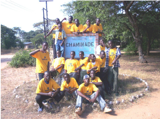
Students in Malawi proudly wear their t-shirts and display solidarity for their Moeller “e-pals.”