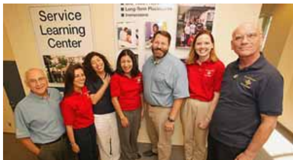
with the Staff of the Service Learning Center Spring 2004