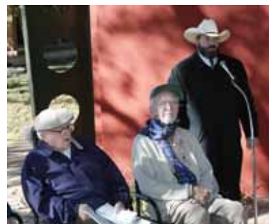
with the Brothers of the Society of Mary in 2003 at a Marianist Forum event