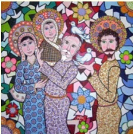
Jesus at the Temple With Simon